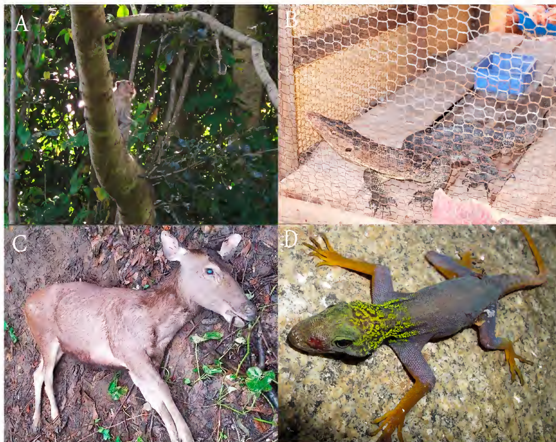
Fig. 5. A. Introduced macaque on Hon Khoai Island; B. Trapped Water Monitor Lizard for consumption; C. Deer killed by blasting of granite outcrops; D. Naturally occurring but injured C. psychedelica .

The present population estimation suggests a stable and actively reproducing population of C. psychedelica at least on Hon Khoai Island. While densities of the species at untouched sites were found to generally have increased from wet to dry season, we observed a decrease of the individual number in the areas, which were most strongly affected by habitat degradation. We assume that the current habitat destruction as well as the planned development of ecotourism will probably interfere with C. psychedelica natural populations, because the species was found to flee hastily in response to the presence of humans. Touristic activities and the presence of humans were already found to negatively affect other range restricted lizards such as Shinisaurus crocodilurus or Goniurosaurus species in northern Vietnam (Ngo et al. 2016; van Schingen et al. 2015). Regarding the small size of Hon Khoai Island, the availability of remaining alternative sites for C. psychedelica is limited. Since the species was only discovered in 2010, long-term population data is lacking and long-term consequences of habitat alteration are not yet investigated in detail.